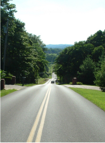
Longview Drive Sumner County, TN

When was the last time driving was a pleasure? It seems that as I get older, the experience of driving in the northeast's congested conditions, with the attendant stress of overly aggressive drivers, all in a hurry to get somewhere, becomes more unpleasant with each passing year.