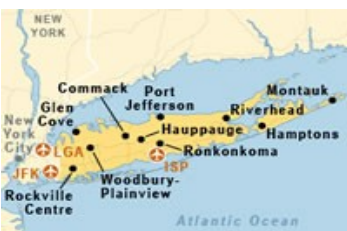
Long Island, New York — Our home for over sixty years. We left for Hendersonville, TN in 2005.

On 6/6/09 LI Newsday reported that "As state officials struggle to close gaping holes in the budget and deal with skyrocketing retirement costs, records show that at least 1,325 retirees collect six-figure pensions from the state - and nearly one-half of them are from Long